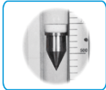
Float with PTFE Ring avoids glass to metal contact and minimizes possibility of Glass Tube breakage