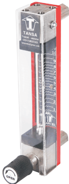
Low Flow Rotameter (LFR)